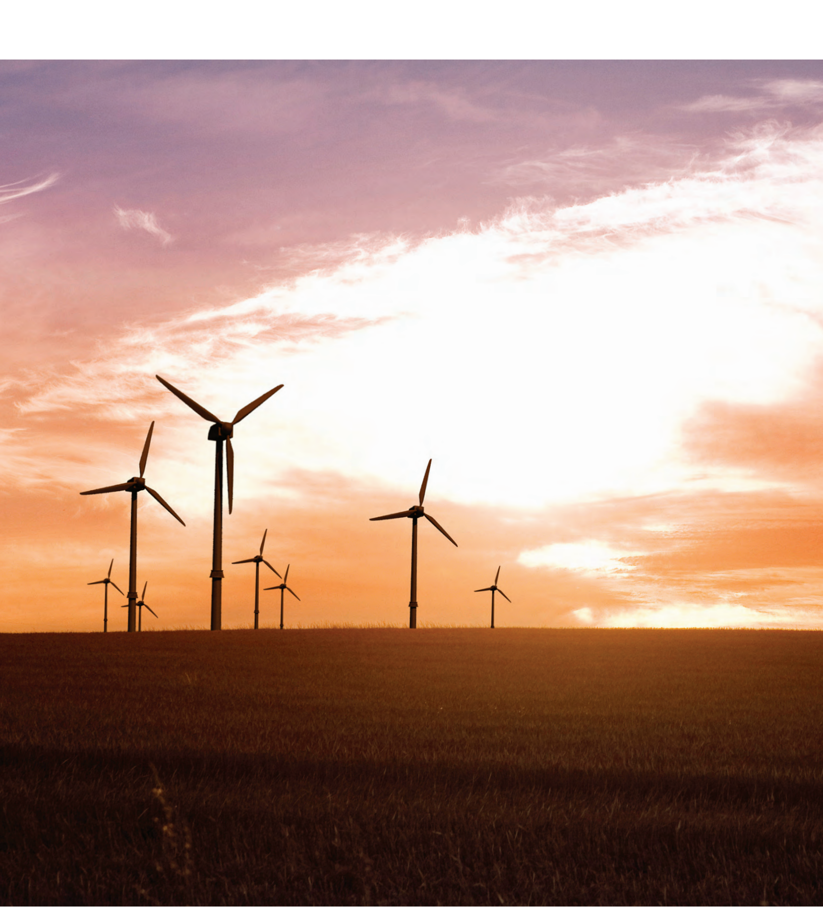
Part II: Improving the Governance of Government-owned Utilities